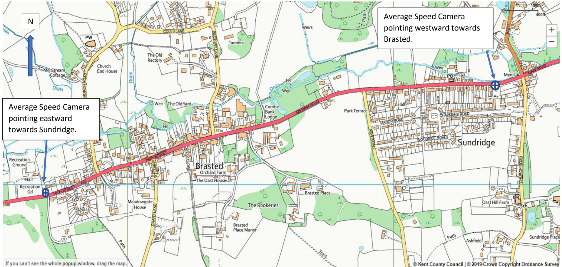
Location Plan of Temporary Average Speed Cameras